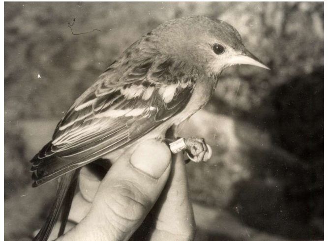
Summer Tanager Bardsey Island, 1957